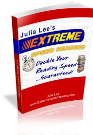
Extreme Speed Reading Ebook How to achieve reading speeds that are so fast, you can cut down the time you currently take to read a book BY HALF.